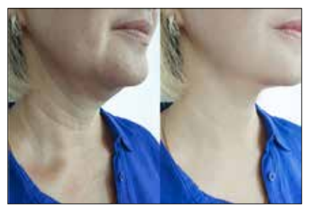
MESO COCKTAILS FOR NECK AND DÉCOLLETÉ