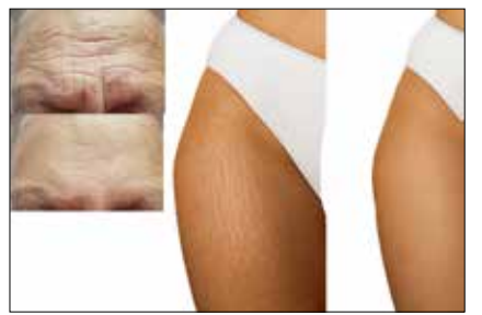
MESO COCKTAILS FOR STRETCH MARKS, SCARS, AND DEEP WRINKLES