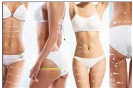
MESO COCKTAILS FOR BODY, STOMACH, HIPS, AND LEGS