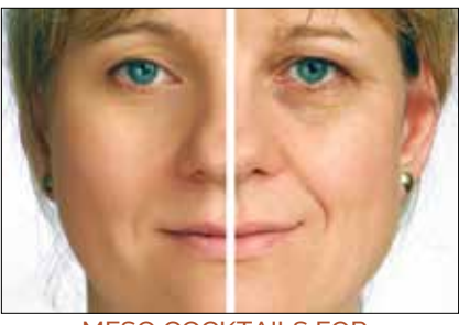
MESO COCKTAILS FOR THE FACE